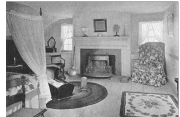
The bedroom on the second floor as it appeared when the museum first opened in 1916.

Some rooms were furnished with the goal of recreating a New York interior in the year 1800. They collected furniture and objects dating to the 18th and 19th centuries, some of which originally belonged to the Dyckman family. Their museum rooms reflected the early 20th century romantic view of colonial life. This contrast is reflected by the two bedrooms we have on view. On the first floor is a bedroom, perhaps that of Jacobus, as it would have been arranged in the early 19th century. On the second floor we have maintained a bedroom as it would have appeared when the museum first opened in 1916. Do you notice the difference?