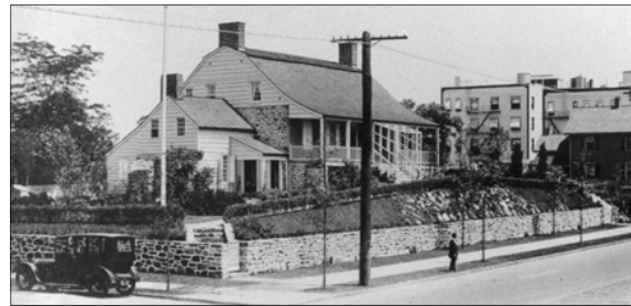
The farmhouse soon after it opened as a museum in 1916.