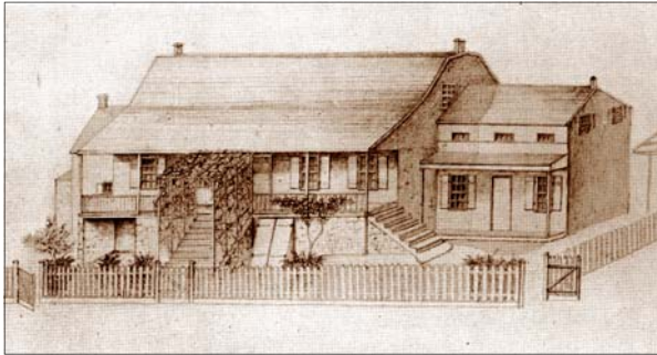
The earliest sketch of the farmhouse, c. 1835. The addition on the right was torn down in 1915-16.